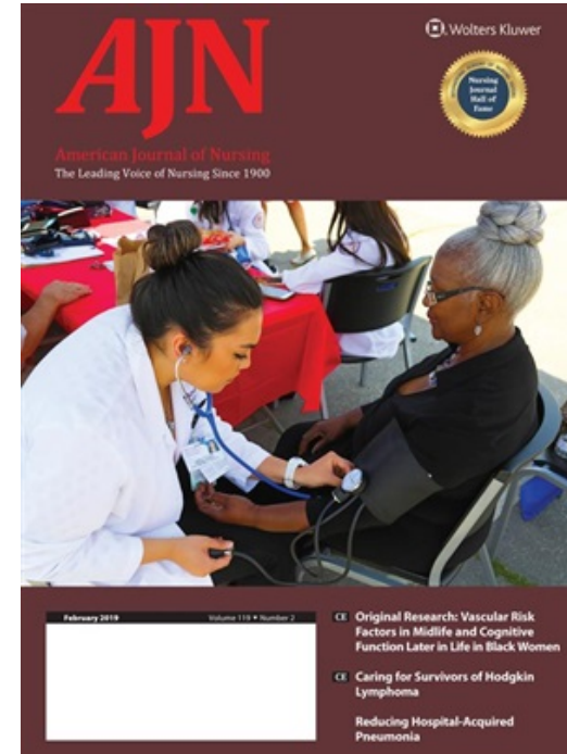
Current edition of AJN